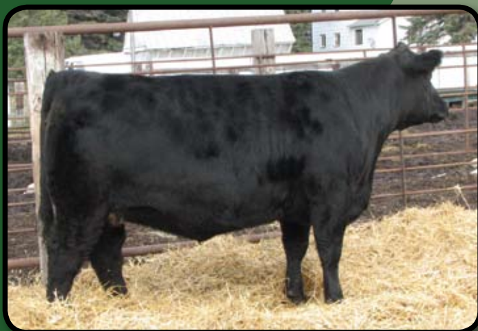
THSR Miss W905 ES Kilowat KH19 X 3C Pasque 8773 EPDs: 7 -1.7 35 63 3 5 22 AI Bred to Dikeman Sure Bet, due on 1-28-2011