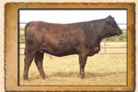
MLC Ms Ciscokidd W544 • 2500148

CE BW WW YW MCE Milk MWW Marb REA API TI 7 0 32 53 8 5 21 0.1 0.12 96 61