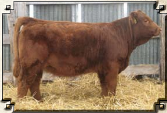
RED KNIGHT X REMINGTON RED LABEL CE BW WW YW MCE MM MWW API TI 2.6 -9 32 53 1.2 5 21 91 59 BW 79 lbs WW 620 lbs