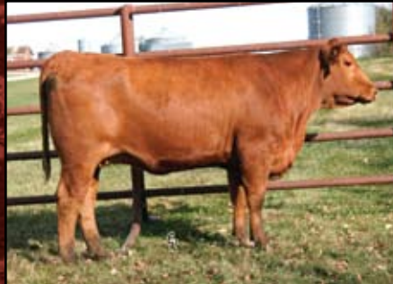
Miss GD W8 BJR C Chief Sit x KS Bravado EPDs: * -4.8 6 12 * 5 8 AI Bred to Hook's Shear Force 5/12/2010. Ultrasound safe with a heifer calf.