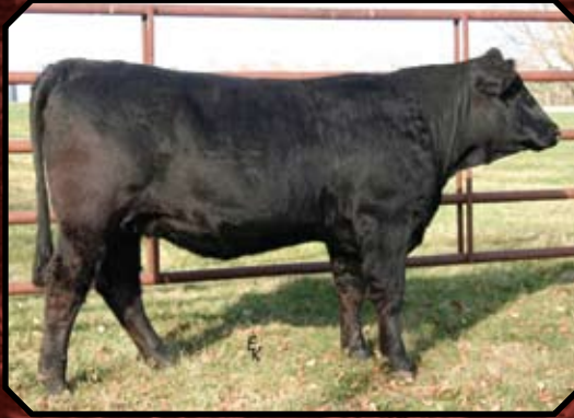
Miss GD W459 SRS Fortune 500 x KS Red By Design EPDs: 6 1.3 36 67 -2 3 21 AI Bred to Hook's Shear Force 5/12/2010 Safe with heifer calf.

Watch for our Consignments to the North Dakota Classic Sale Saturday, December 18, 2010 Bismarck, ND