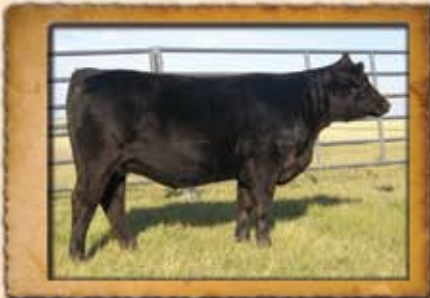
HSR Ms Cisco Kid W100 • 2540018

CE BW WW YW MCE Milk MWW Marb REA API TI 0 -0.3 40 81 0 1 21 0.58 -0.14 120 76