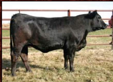
Miss GD W96 SRS Preferred Beel x Rains Limit Up EPDs: 9 0.9 25 47 2 3 15 AI Bred to Hook's Shear Force 5/12/2010. Ultrasound safe with a heifer calf.