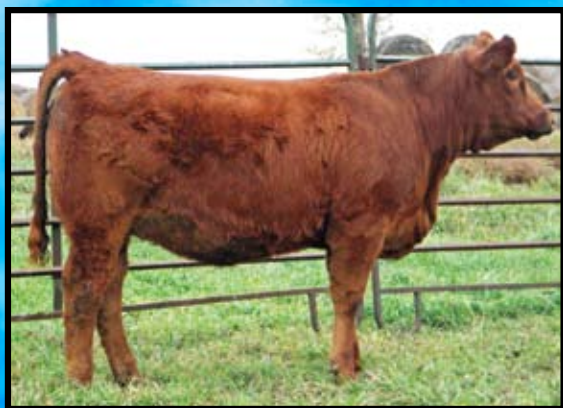
BCLR MISS TONIC X260-1 Ankonian Red Caesar x Lman King Rob EPDs: * 0.4 36 69 * 6 24 BD: 2/13/2010