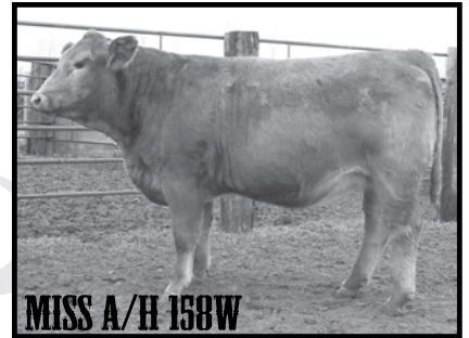
MISS A/H 158W