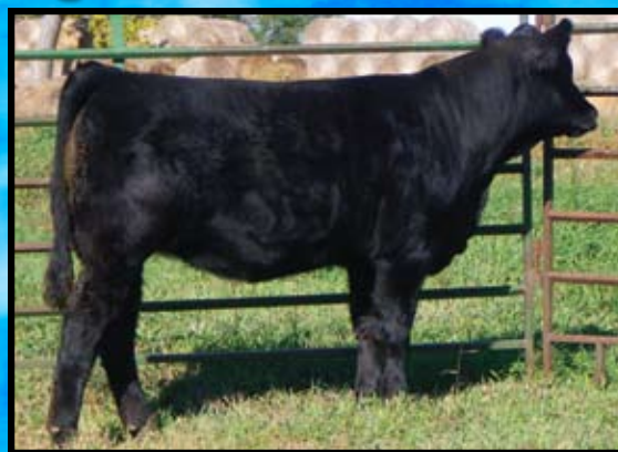
BCLR MISS BELLE X 610 Triple C Invasion x STF Montana Black EPDs: 7 2.5 28 49 -1 2 16 BD: 2/24/2010 NDSA Donation Heifer!