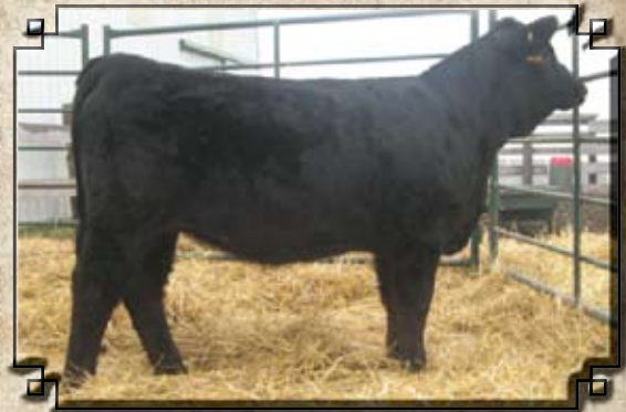
SHEAR FORCE X TNT DYNAMITE BLACK CE BW WW YW MCE MM MWW API TI 12.4 -2.6 32.9 56.6 5.8 6.8 23.3 127 71 BW 73 lbs WW 660 lbs