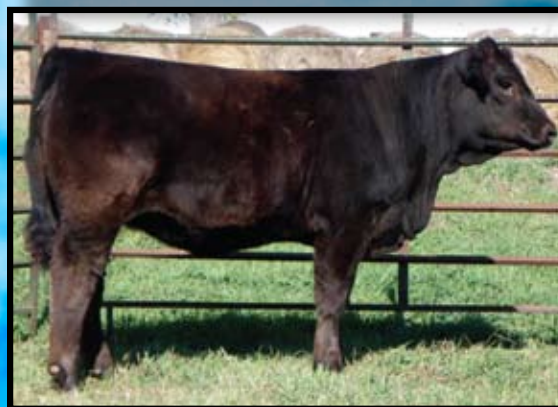
BCLR MISS MIKAYLA X617 WS Beefmaker x TNT Tonner EPDs: 10 2.1 40 64 -2 3 23 BD: 2/24/2010