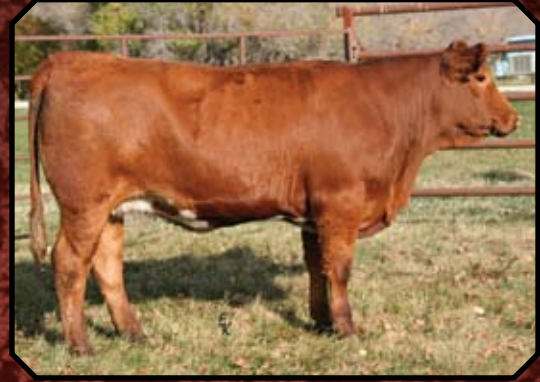
Miss GD W325 THSF Freedom x Hooks Red Quorum EPDs: 5 -0.9 35 71 5 4 21 AI Bred to Hook's Shear Force 5/12/2010. Ultrasounded with a bull calf.