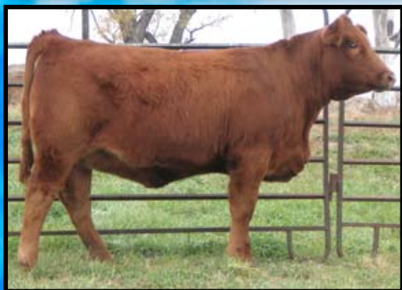
BCLR MISS GIN X260-2 Ankonian Red Caesar x Lman King Rob EPDs: * 0.4 36 69 * 6 24 BD: 2/16/2010