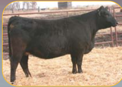
Sold in the 2010 Edge of the West Female Sale to Scott Werning, SD

For More Information on the Edge of the West Female Sale, contact: