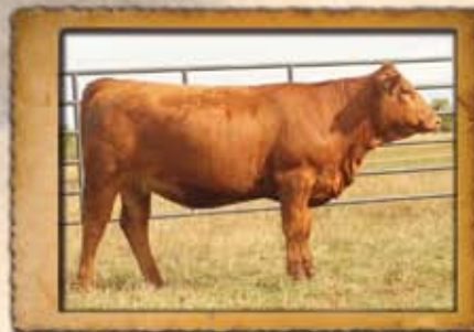
MLC Ms Gunner W568 • 2500052

CE BW WW YW MCE Milk MWW Marb REA API TI 0 0 32 73 0 9 25 0.25 0 99 62