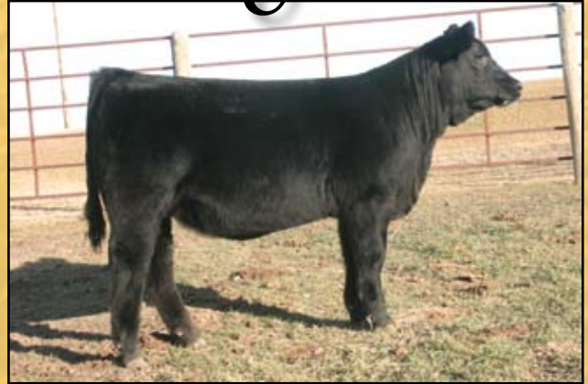
Hennessy One Shot X554 4E Rolls Royce U22 x CNS Dream On EPDs: 7 1.6 30 53 4 1 16 BD: 3/15/2010