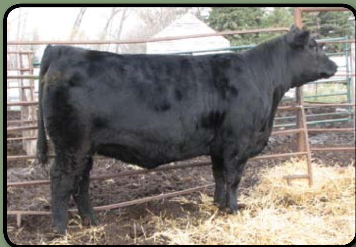
THSR Wilona W 912 Morgans Direction 111 99 x TNT Top Cut EPDs: -1.9 49 97 11 36 AI Bred to Dikeman Sure Bet, due on 1-26-2011