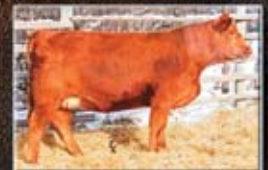
KS U558 - Sold to Bata Brothers

For more of these genetics, attend the Kenner Simmental Sale, February 12, 2011 in Bismarck, ND.