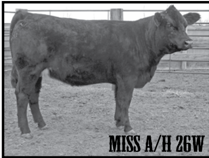
MISS A/H 26W