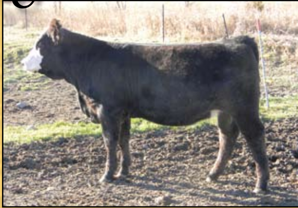
4E Shasha STF Denied U155 x Calico Fearless 113L EPDs: 6 4.4 43 82 2 1 23 BD: 2/12/2010