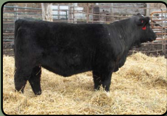
THSR Xidorn X043 Dikemans Sure Bet x CNS Dream On EPDs: 13 -0.8 46 77 7 -1 22