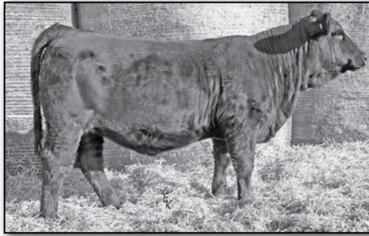
NPS Miss Superiority X047 - BD: 2/20/2010