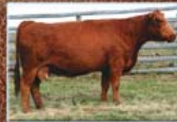
Riv Red Brigadia 969J

Xandra's full sister sold to Bata Brothers last year in the Kenner Production Sale. This heifer is a sweetheart and will impress you with the muscle shape she has already. Her grandmother is now in our donor program and is the mother of KS Bravado and KS Gemini. Each year, her calves sell at the top! A good cow family behind X558.