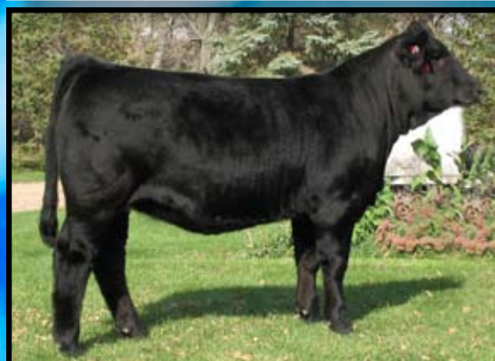
JSF BAILEY 24X Westfall Voyager x TNT Gunner EPDs: 9 1.3 36 62 7 5 22 BD: 2-1-10