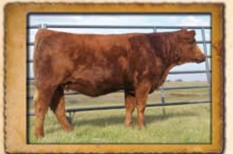
HSR Ms Beef Maker W118 • 2540024

CE BW WW YW MCE Milk MWW Marb REA API TI 8 0.4 27 55 3 8 22 0.28 0.31 121 64