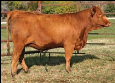
Miss GD W45 KS Bravado x CK Monu 8024 EPDs: * -1.8 22 37 * 9 20 AI Bred to Hook's Shear Force 5/12/2010. Ultrasound safe with a bull calf.