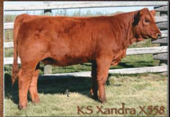
KS Xandra X558

Look them up at the ND Simmental Classic Sale, December 18! North Dakota Simmental Association Classic Sale December 18, 2010 Bismarck, North Dakota