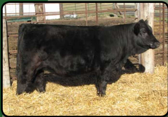
THSR Xantara X013 NLC Superior x SRS Fortune 500 EPDs: 6 1.4 32 65 2 11 27