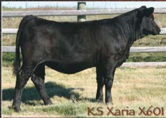
KS Xaria X601

LFEBISS Black Advance x KS Correlator EPDs: 7 -1 27 49 1 2 16 March calf that is stylish and carries a tremendous amount of rib and muscle. The Advance calves are impressive and there are many in the bull pen for February!