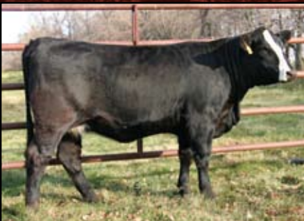
Miss GD W3A Sitz Upward x Lucky Break EPDs: * -1.3 37 84 * 5 24 AI Bred to Hook's Shear Force 5/12/2010. Ultrasound safe, sex unknown.