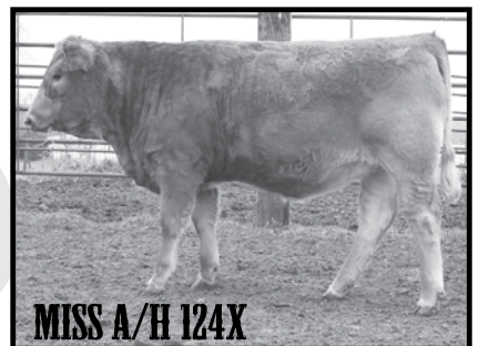
MISS A/H 124X

PERFORMANCE, CARCASS, MATERNAL & DISPOSITION!