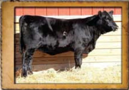
DKSR Ms Touchdown X25 • 2545598

Farmers Livestock Exchange Bismarck, N.D.