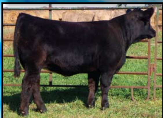
BCLR MISS MILEY X820 SS Ebony's Grandmaster x Triple C Invasion EPDs: 14 -2.9 39 64 -3 6 26 BD: 2/21/2010