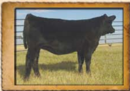
HSR Ms Fantasia X602 • 22545458

CE BW WW YW MCE Milk MWW Marb REA API TI 4 2 34 72 1 9 27 0.18 0.49 116 64