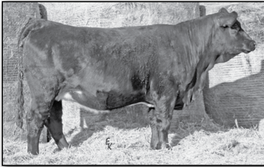
NPS Miss Knockdown W972 - BD: 2/21/2009