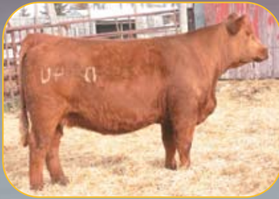
Sold in the 2010 Edge of the West Female Sale to Kenner Simmentals, ND

These two females represent the type and kind you will find in the Edge of the West Female Sale!