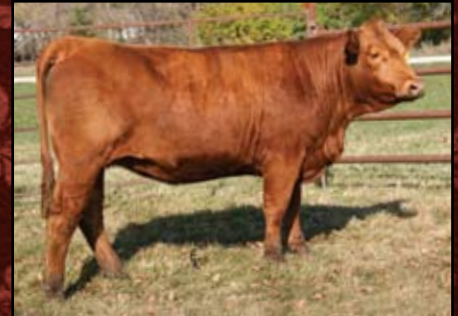
Miss GD W7 SRS Fortune 500 x KS Bravado EPDs: 9 0.5 32 58 0 7 23 AI Bred to Hook's Shear Force 5/12/2010. Ultrasound safe with a heifer calf.